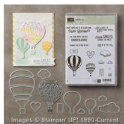
Lift Me Up Clear-Mount Bundle - 144712

Margie Calenda mybroomstick01@gmail.com http://magicalmargie.blogspot.com