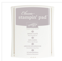
Smoky Slate Classic Stampin' Pad - 131179