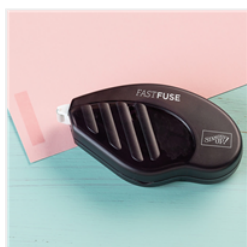
Fast Fuse Adhesive - 129026