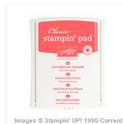
Watermelon Wonder Classic Stampin' Pad - 138323