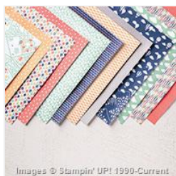
Carried Away Designer Series Paper - 143608