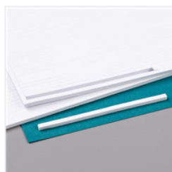
Foam Adhesive Strips - 141825