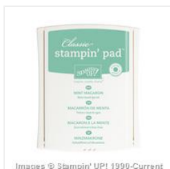
Mint Macaron Classic Stampin' Pad - 138326