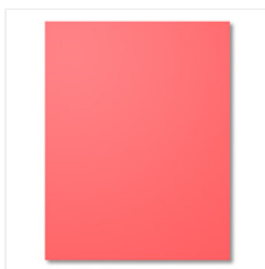
Watermelon Wonder 8-1/2" X 11" Cardstock - 138334