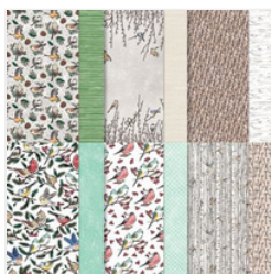
Nests Of Winter 12" X 12" (30.5 X 30.5 Cm) Designer Series Paper - 164183