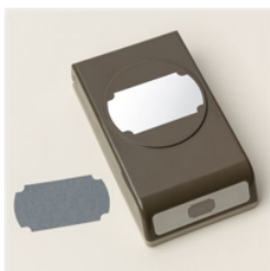
Labeled With Love Punch - 163569