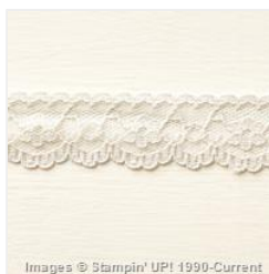
Sahara Sand 7/8" (2.2 Cm) Lace Trim - 137866