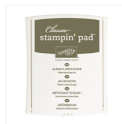
Always Artichoke Classic Stampin' Pad - 126972