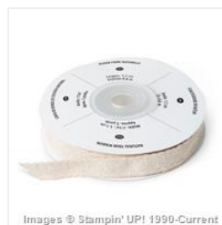
7/16" Natural Trim Ribbon - 129287