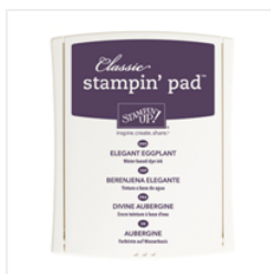
Elegant Eggplant Classic Stampin' Pad - 126969