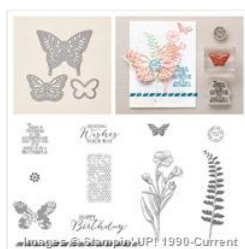
Butterfly Basics Photopolymer Bundle - 138865

http://www.stampinup.net/esuite/home/onestampatatimewest/