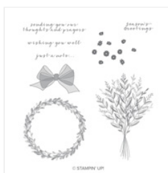
Wishing You Well Clear-Mount Stamp Set - 147864