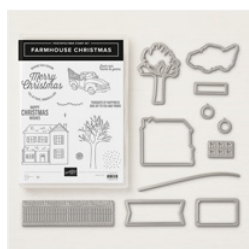
Farmhouse Christmas Photopolymer Bundle - 149941