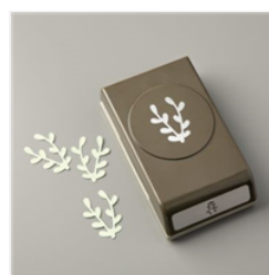
Sprig Punch - 148012