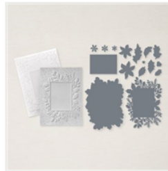
Merriest Frames Hybrid Embossing Folder - 156385