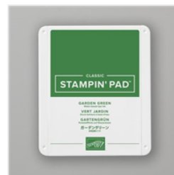
Garden Green Classic Stampin' Pad - 147089