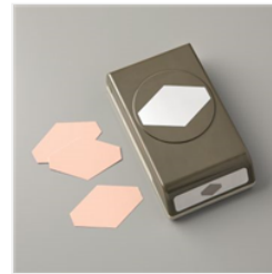
Tailored Tag Punch - 145667