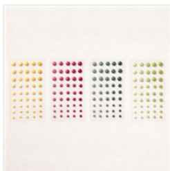
Decorative Matte Dots - 156289