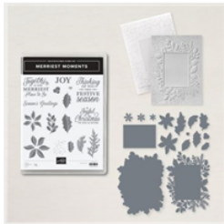
Merriest Moments Bundle (English) - 156783