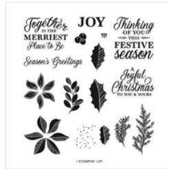
Merriest Moments Photopolymer Stamp Set (English) - 156353