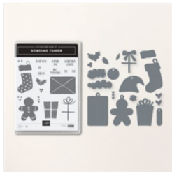
Sending Cheer Bundle (English) - 162053

stampingwithmore@gmail.com http://www.stampingwithmore.com