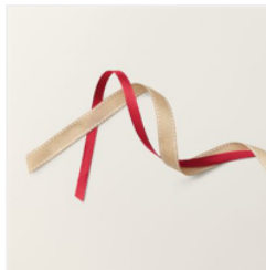
Real Red & Burlap Ribbon Combo Pack - 160386