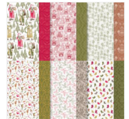
Traditions Of St. Nick 12" X 12" (30.5 X 30.5 Cm) Designer Series Paper - 162355