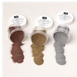
Metallic Embossing Powders - 155555