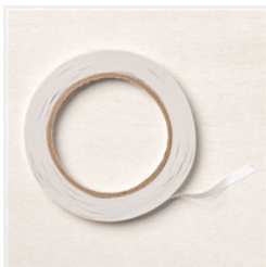
Tear & Tape Adhesive - 154031