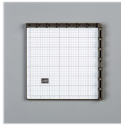
Stamparatus - 146276