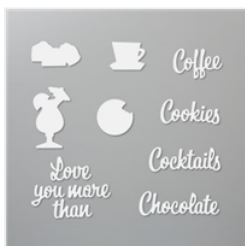
Love You More Than Dies - 152698