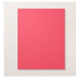
Sweet Sorbet 8-1/2" X 11" Cardstock - 159268