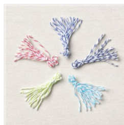
2022-2024 In Color Baker's Twine Pack - 159195