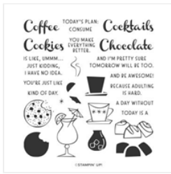
Nothing's Better Than Photopolymer Stamp Set (English) - 158295

Judith Patterson judith@judithpatterson.net www.judithpatterson.net