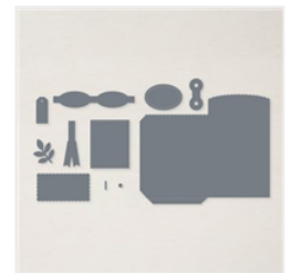
Mini Pocket Envelope Dies - 159167