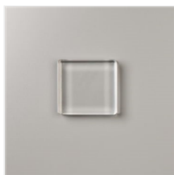
Clear Block D - 118485