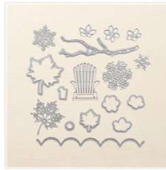
Seasonal Layers Dies - 143751