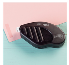
Fast Fuse Adhesive - 129026