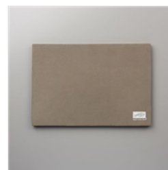
Stampin' Pierce Mat - 126199