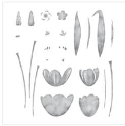
Tranquil Tulips Photopolymer Stamp Set - 143767