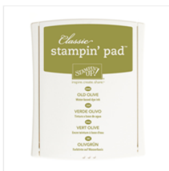
Old Olive Classic Stampin' Pad - 126953