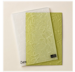
Layered Leaves Dynamic Textured Impressions Embossing Folder - 143704