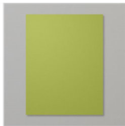
Old Olive 8-1/2" X 11" Cardstock - 100702