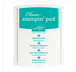
Bermuda Bay Classic Stampin' Pad - 131171