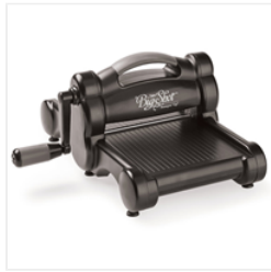
Big Shot - 143263