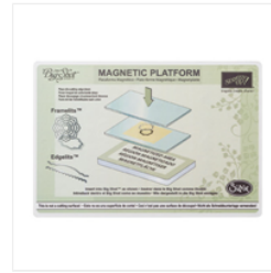
Magnetic Platform - 130658