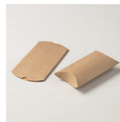
Kraft Pillow Boxes - 147018