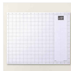
Crafting Grid Paper - 167765