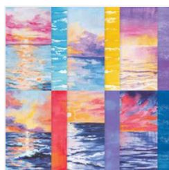
Scenic Coast 6" X 6" (15.2 X 15.2 Cm) Specialty Designer Series Paper - 167773