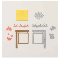
Wonderful Scenes Dies (English) - 168665