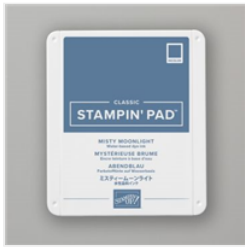
Misty Moonlight Classic Stampin' Pad - 153118

Rachel Tessman 763-502-6813 stampyourartout@comcast.net www.stampyourartout.com