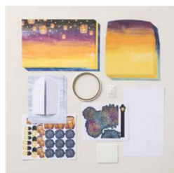
Sparkling Celebrations Paper Pumpkin Refill (English) - 171465