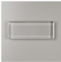
Clear Block I - 118488