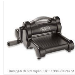
Big Shot - 113439