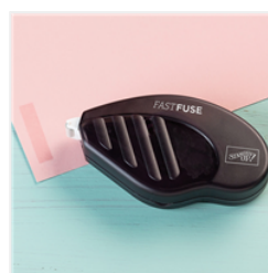
Fast Fuse Adhesive - 129026