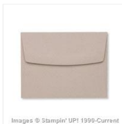
Crumb Cake Medium Envelopes - 107297