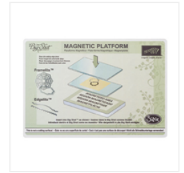
Magnetic Platform - 130658