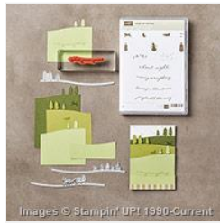
Jingle All The Way Clear-Mount Bundle - 140862