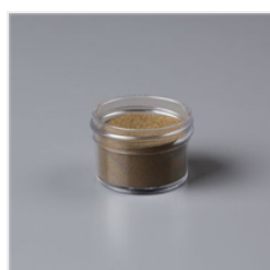
Gold Stampin' Emboss Powder - 109129