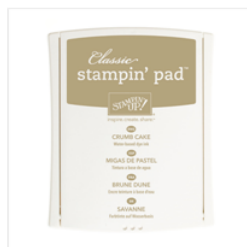
Crumb Cake Classic Stampin' Pad - 126975