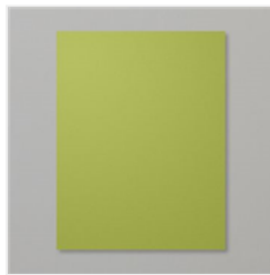
Old Olive 8-1/2" X 11" Cardstock - 100702