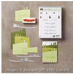
Jingle All The Way Wood-Mount Bundle - 140861

stampwithmarybush@yahoo.com www.stampinthesand.stampinup.net