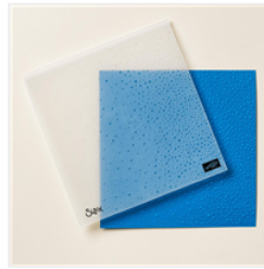
Softly Falling Textured Impressions Embossing Folder - 139672