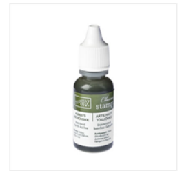
Always Artichoke Classic Stampin' Ink Refill - 105232