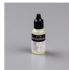
VersaMark Ink Refill - 102193