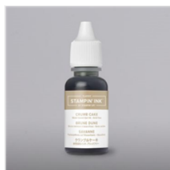
Crumb Cake Classic Stampin' Ink Refill - 121029

stampwithmarybush@yahoo.com www.stampinthesand.stampinup.net