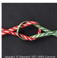
Real Red & Garden Green 1/8" (3.2 Mm) Striped Ribbon - 139615