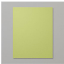
Pear Pizzazz 8- 1/2" X 11" Cardstock - 131201