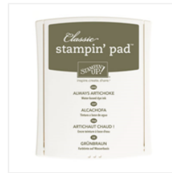
Always Artichoke Classic Stampin' Pad - 126972