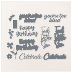
Wanted To Say Dies - 161594