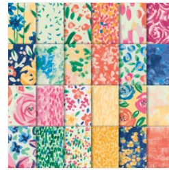
Garden Impressions 6" X 6" (15.2 X 15.2 Cm) Designer Series Paper - 146289