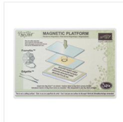
Magnetic Platform - 130658