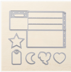
Wood Crate Framelits Dies - 143730