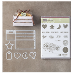
Wood Words Clear-Mount Bundle - 145316