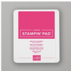
Melon Mambo Classic Stampin' Pad - 147051