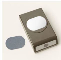
Modern Oval Punch - 162234