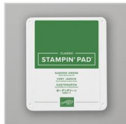
Garden Green Classic Stampin' Pad - 147089