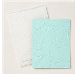
Painted Texture 3D Embossing Folder - 154317