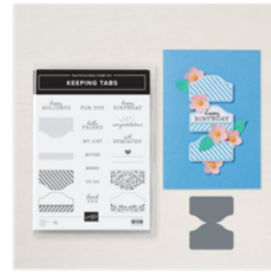
Keeping Tabs Dies Bundle (English) - 163543