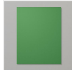
Garden Green 8-1/2" X 11" Cardstock - 102584