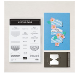
Keeping Tabs Punch Bundle (English) - 163540