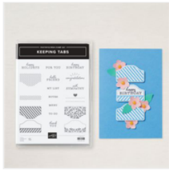
Keeping Tabs Photopolymer Stamp Set (English) - 163533

Susie Wood (641) 660-2537 ds52wood@gmail.com www.susiewood.stampinup.net