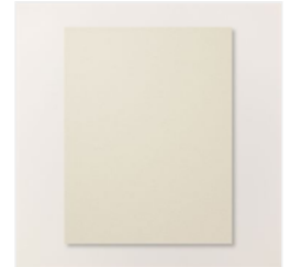
Basic Beige 8-1/2" X 11" Cardstock - 164511