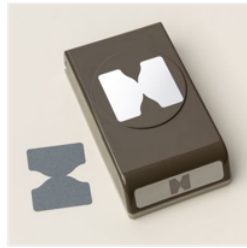
Keeping Tabs Punch - 163538