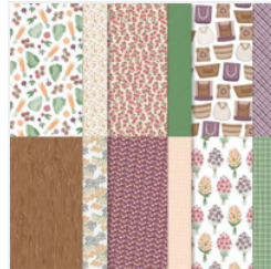
To Market 12" X 12" (30.5 X 30.5 Cm) Designer Series Paper - 163421