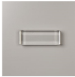
Clear Block H - 118490