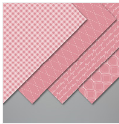
2019-2021 In Color 6" X 6" (15.2 X 15.2 Cm) Designer Series Paper - 149617