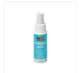
Stampin' Mist - 102394