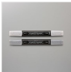
Stampin Blends Smoky Slate Combo Pack - 145058