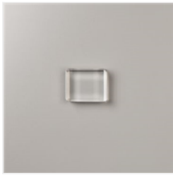
Clear Block B - 117147