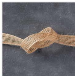
5/8" (1.6 Cm) Burlap Ribbon - 141487