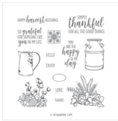
Country Home Photopolymer Stamp Set (En) - 147678