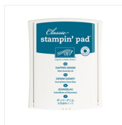
Dapper Denim Classic Stampin' Pad - 141394 Price: $6.50