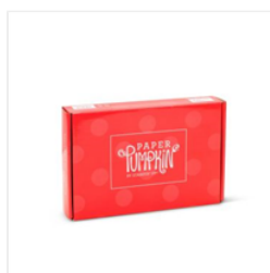
Prepaid Paper Pumpkin Subscription 1- Month - 137858 Price: $24.00