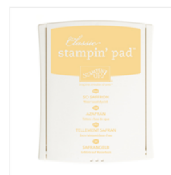
So Saffron Classic Stampin' Pad - 126957 Price: $6.50