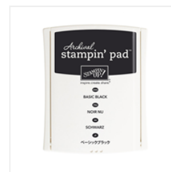
Basic Black Archival Stampin' Pad - 140931 Price: $7.00