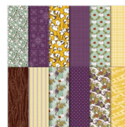
Country Lane 12" X 12" (30.5 X 30.5 Cm) Designer Series Paper - 147804