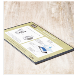
Precision Base Plate - 139684