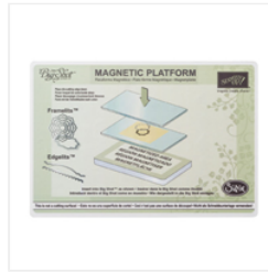
Magnetic Platform - 130658