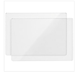
Standard Cutting Pads - 113475