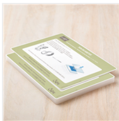
Big Shot Platform - 142802