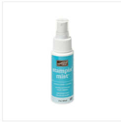
Stampin' Mist - 102394