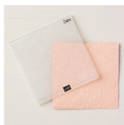
Tin Tile Dynamic Textured Impressions Embossing Folder - 147906