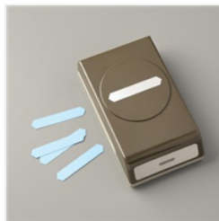
Stanze Klassisches Etikett - 141491