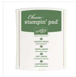
Garden Green Classic Stampin' Pad - 126973