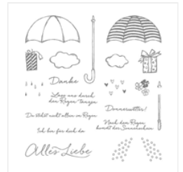
Donnerwetter Photopolymer Stamp Set (German) - 142293