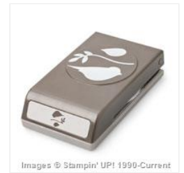
Bird Builder Punch - 117191