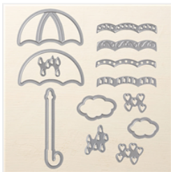
Umbrella Weather Framelits Dies - 141479