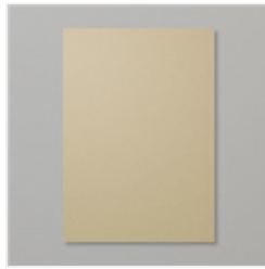
Farbkarton A4 Savanne - 121685