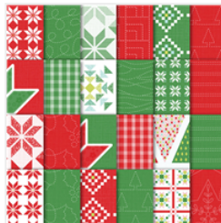
Quilted Christmas 6" X 6" (15.2 X 15.2 Cm) Designer Series Paper - 144617