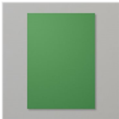
Farbkarton A4 Gartengrün - 108605