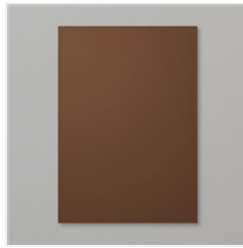
Farbkarton A4 Espresso - 121686