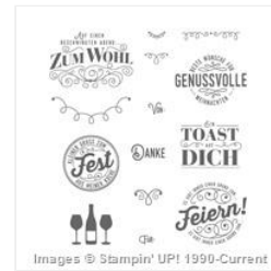
Nette Etiketten Clear-Mount Stamp Set (German) - 143043