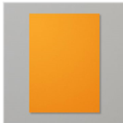
Farbkarton A4 Kürbisgelb - 108601