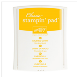
Crushed Curry Classic Stampin' Pad - 131173

Doris Pichler +43 664 630 7603 office@dorispichler.at http://www.dorispichler.at/blog/