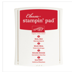
Real Red Classic Stampin' Pad - 126949