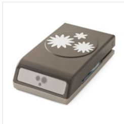
Blossom Bunch Punch - 140612