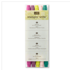
2017-2019 In Color Stampin' Write Markers - 144033