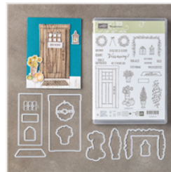
Wie Zu Hause Photopolymer Bundle (German) - 145353