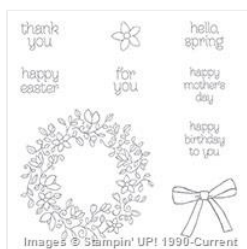
Circle Of Spring Photopolymer Stamp Set - 138964