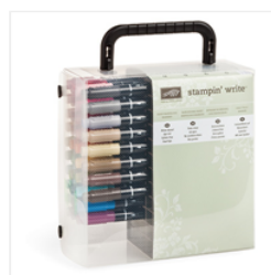
Many Marvelous Markers - 131264