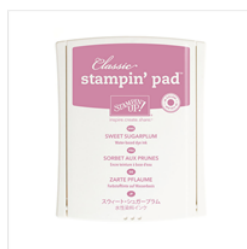
Sweet Sugarplum Classic Stampin' Pad - 141395