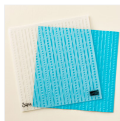
Festive Textured Impressions Embossing Folder - 141471