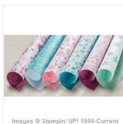
Blooms & Bliss Designer Series Paper - 141654