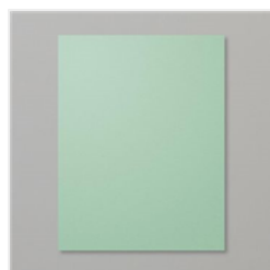
Mint Macaron 8-1/2" X 11" Cardstock - 138337