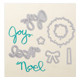
Wonderful Wreath Framelits Dies - 135851