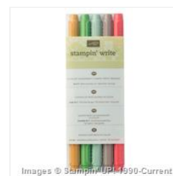
2015-2017 In Color Stampin' Write Markers - 138333