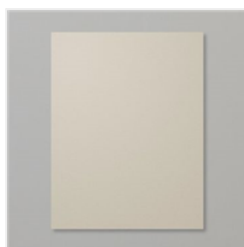
Sahara Sand 8-1/2" X 11" Cardstock - 121043