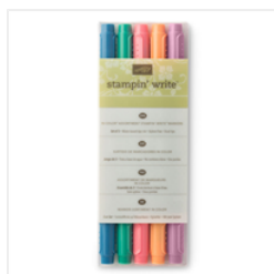
2016-2018 In Color Stampin' Write Markers - 141393