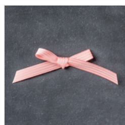
Blushing Bride 3/8" (1 Cm) Stitched Satin Ribbon - 141692