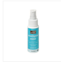
Stampin' Mist - 102394