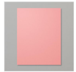
Flirty Flamingo 8- 1/2" X 11" Cardstock - 141416