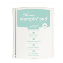
Pool Party Classic Stampin' Pad - 126982