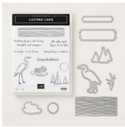
Lily Pad Lake Clear-Mount Bundle - 148366