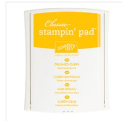
Crushed Curry Classic Stampin' Pad - 131173