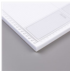
Grid Paper - 130148