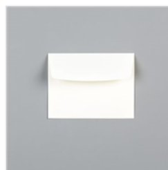
Very Vanilla Medium Envelopes - 107300