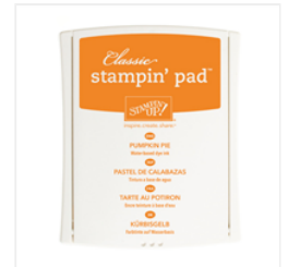
Pumpkin Pie Classic Stampin' Pad - 126945