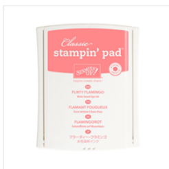
Flirty Flamingo Classic Stampin' Pad - 141397