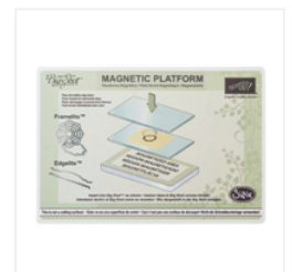
Magnetic Platform - 130658