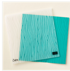
Seaside Textured Impressions Embossing Folder - 141481