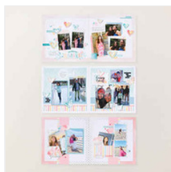
Extraordinary Life Scrapbooking Workshop Kit (English) - 167711