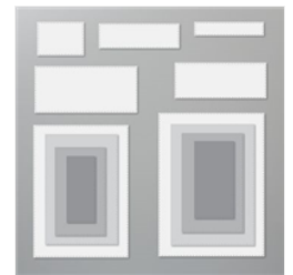
Rectangle Stitched Dies - 151820