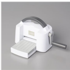
Mini Stampin' Cut & Emboss Machine - 150673