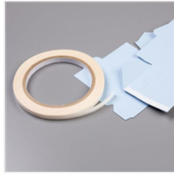
Tear & Tape Adhesive - 138995