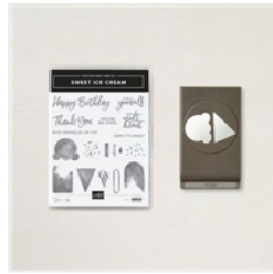
Sweet Ice Cream Bundle (English) - 156244