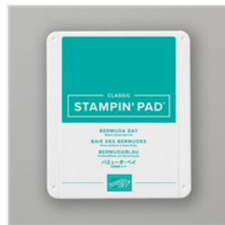
Bermuda Bay Classic Stampin' Pad - 147096