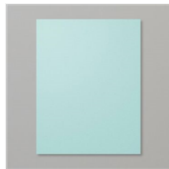
Pool Party 8-1/2" X 11" Cardstock - 122924