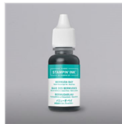
Bermuda Bay Classic Stampin' Ink Refill - 131156