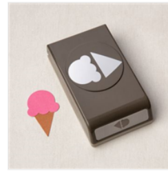
Ice Cream Cone Builder Punch - 154241