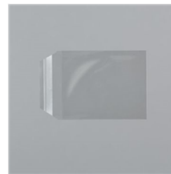
Clear Translucent Medium Envelopes - 102619