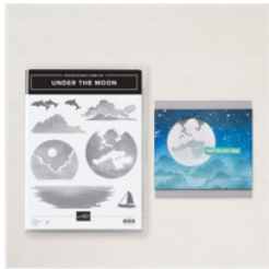
Under The Moon Photopolymer Stamp Set - 163531