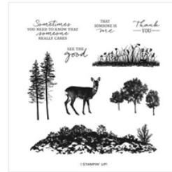
Grassy Grove Cling Stamp Set (English) - 157836