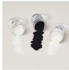
Basics Wow! Embossing Powder - 165679