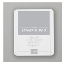
Smoky Slate Classic Stampin' Pad - 147113