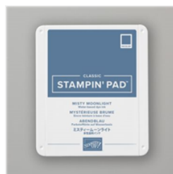
Misty Moonlight Classic Stampin' Pad - 153118