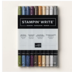
Neutrals Stampin' Write Markers - 161697