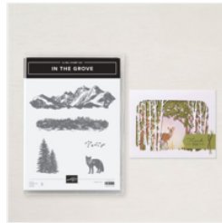
In The Grove Cling Stamp Set - 164459