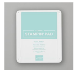
Pool Party Classic Stampin' Pad - 147107