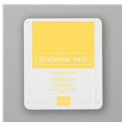
Daffodil Delight Classic Stampin' Pad - 147094