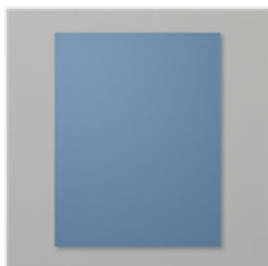
Misty Moonlight 8-1/2 X 11" Cardstock - 153081