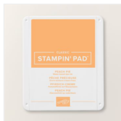
Peach Pie Classic Stampin' Pad - 163810