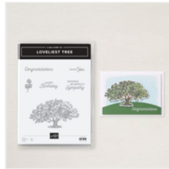
Loveliest Tree Cling Stamp Set (English) - 163714