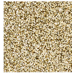
Gold Glimmer Paper - 133719 Price: $5.00