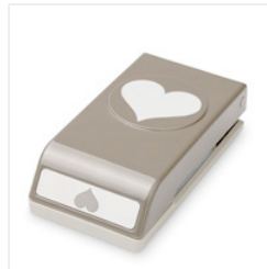
Sweetheart Punch - 133786 Price: $16.00