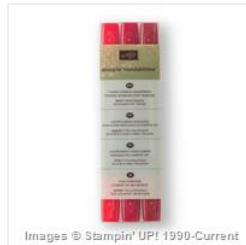
Stampin' Blendabilities™ Markers Cherry Cobbler Assortment - 139924 Price: $0.00