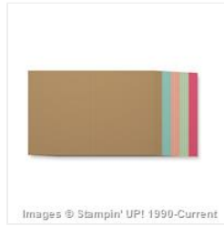
2013-2015 In Color Cut & Ready Card Bases - 136660 Price: $4.95