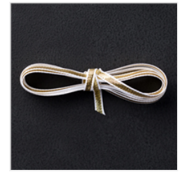
Gold 1/8\" (3.2 Mm) Ribbon - 134583 Price: $5.00