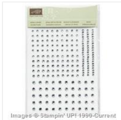
Rhinestone Basic Jewels - 119246 Price: $5.00