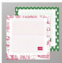
Seasonal 2019 13" X 13" (33 X 33 Cm) Grid Paper - 153984