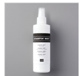
Stampin' Mist - 153648