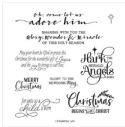
For Unto Us Cling Stamp Set - 153335