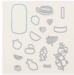
Simply Sparkling Dies - 162870