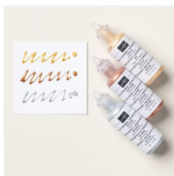
Metallic Enamel Effects Basics - 161610