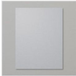
Smoky Slate 8-1/2" X 11" Cardstock - 131202