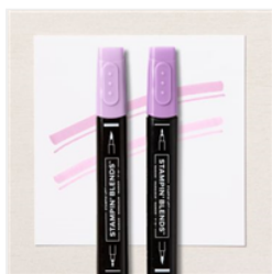
Fresh Freesia Stampin' Blends Combo Pack - 155518