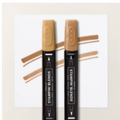
Pecan Pie Stampin' Blends Combo Pack - 161674