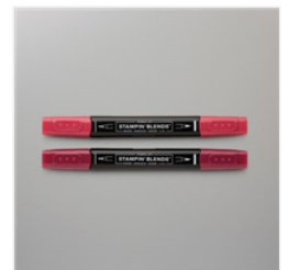
Cherry Cobbler Stampin' Blends Combo Pack - 154880