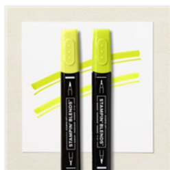
Parakeet Party Stampin' Blends Combo Pack - 159220

Rachel Tessman 763-502-6813 stampyourartout@comcast.net www.stampyourartout.com