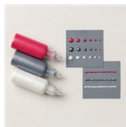
Pearlized Enamel Effects Basics - 156310