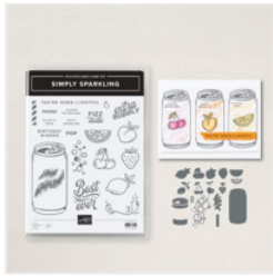
Simply Sparkling Bundle (English) - 162871