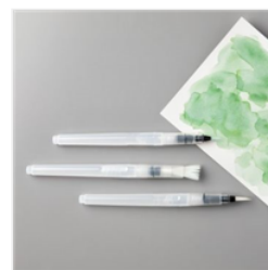
Water Painters - 151298