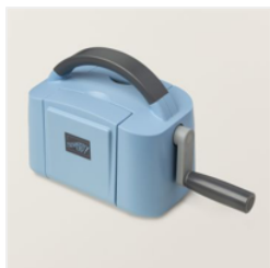
Boho Blue Limited Edition Mini Stampin' Cut & Emboss Machine - 161104