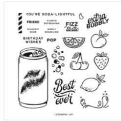
Simply Sparkling Photopolymer Stamp Set (English) - 162866