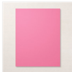
Polished Pink 8-1/2" X 11" Cardstock - 155710