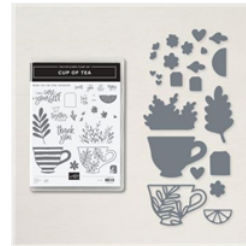
Cup Of Tea Bundle (English) - 158667