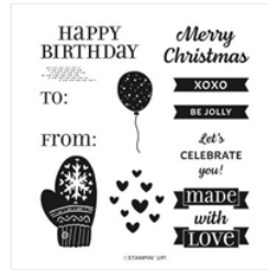
Celebrate With Tags Cling Stamp Set (English) - 159974