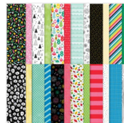
Celebrate Everything 12" X 12" (30.5 X 30.5 Cm) Designer Series Paper - 159913