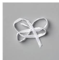
Whisper White 1/4" (6.4 Mm) Crinkled Seam Binding Ribbon - 151326