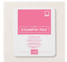
Polished Pink Classic Stampin' Pad - 155712