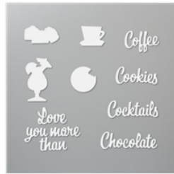
Love You More Than Dies - 152698