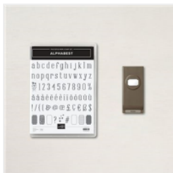
Alphabest Bundle - 158886