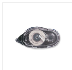
Snail Adhesive - 104332