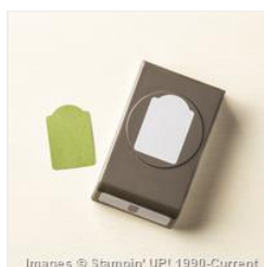
Note Tag Punch - 135860