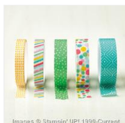
Cherry On Top Designer Washi Tape - 138384