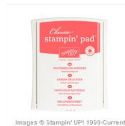
Watermelon Wonder Classic Stampin' Pad - 138323