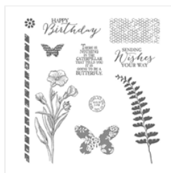
Butterfly Basics Photopolymer Stamp Set - 137154