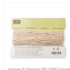
Metallic Gold Baker's Twine - 132975