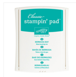
Bermuda Bay Classic Stampin' Pad - 131171