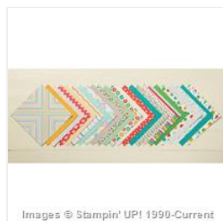
Cherry On Top Designer Series Paper Stack - 138443