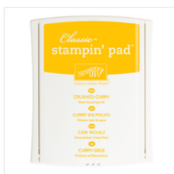
Crushed Curry Classic Stampin' Pad - 131173