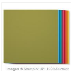
Brights 12" X 12" (30.5 X 30.5 Cm) Cardstock - 131186