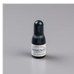
Tuxedo Black Memento Ink Refill - 133456