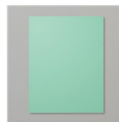
Coastal Cabana 8-1/2" X 11" Cardstock - 131297