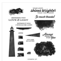
Lighthouse Point Photopolymer Stamp Set (English) - 158901