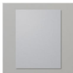
Smoky Slate 8-1/2" X 11" Cardstock - 131202