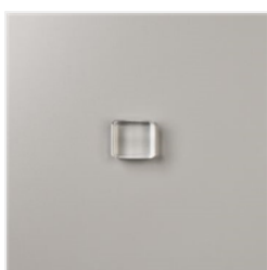
Clear Block A - 118487