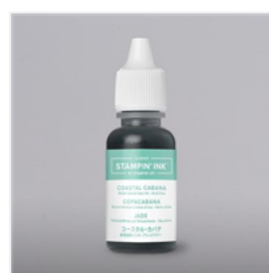
Coastal Cabana Classic Stampin' Ink Refill - 131164