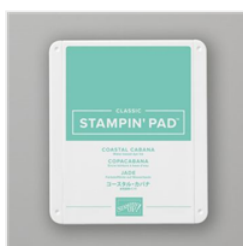
Coastal Cabana Classic Stampin' Pad - 147097