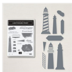
Lighthouse Point Bundle (English) - 158907