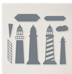
Lighthouse Dies - 158906