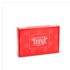
Prepaid Paper Pumpkin Subscription 1-Month - 137858