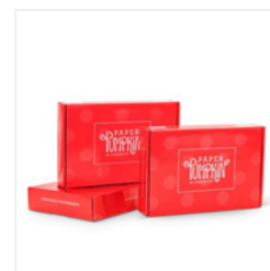
Prepaid Paper Pumpkin Subscription 3-Month - 137859