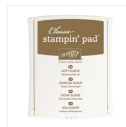
Soft Suede Classic Stampin' Pad - 126978