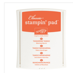
Tangerine Tango Classic Stampin' Pad - 126946