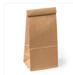
Petite Café Gift Bags - 135826