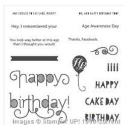
Age Awareness Photopolymer Stamp Set - 135381