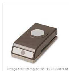
Hexagon Punch - 130919