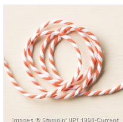
White & Tangerine Tango Two-Tone Trim - 135838