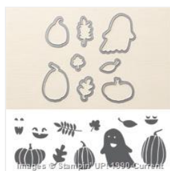
Fall Fest Photopolymer Bundle - 137628

http://becreativewithnicole.blogspot.com