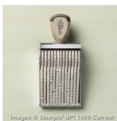
Alphabet Rotary Stamp - 133769