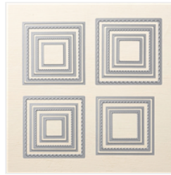
Layering Squares Dies - 141708