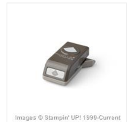
Project Life Corner Punch - 135346