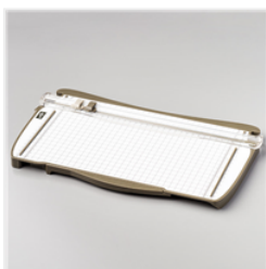
Stampin' Trimmer (Metric) - 129722