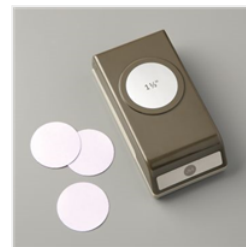
1-1/2" (3.8 Cm) Circle Punch - 138299