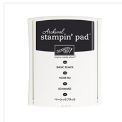
Basic Black Archival Stampin' Pad - 140931