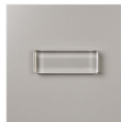
Clear Block H - 118490