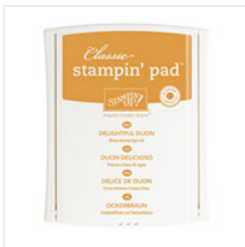
Delightful Dijon Classic Stampin' Pad - 138327