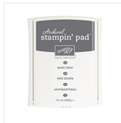
Basic Gray Archival Stampin' Pad - 140932