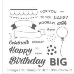
Birthday Bright Photopolymer Stamp Set - 142835