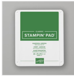
Garden Green Classic Stampin' Pad - 147089