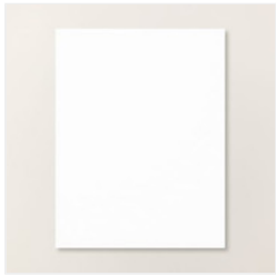
Basic White 8-1/2\" data-bbox="72 235 223 289"/>