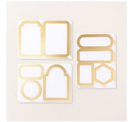
Foiled Frames & Labels Ephemera Pack - 165616