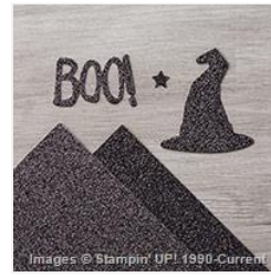
Black Glimmer Paper - 139605