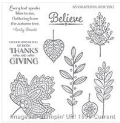
Lighthearted Leaves Photopolymer Stamp Set - 139712

astampingteddy@gmail.com http://stampingincolumbusga.blogspot.com/