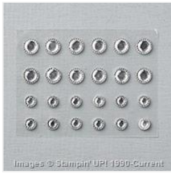
Iced Rhinestone Embellishments - 139637

astampingteddy@gmail.com http://stampingincolumbusga.blogspot.com/