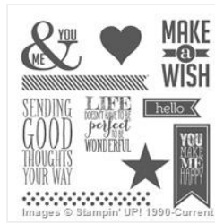
Perfect Pennants Clear-Mount Stamp Set - 133230