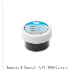
Black Stampin' Emboss Powder - 109133