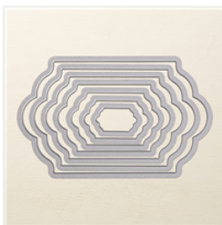
Lots Of Labels Framelits Dies - 138281