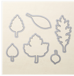
Leaflets Framelits Dies - 138283