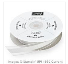
Whisper White 5/8" (1.6 Cm) Organza Ribbon - 114319