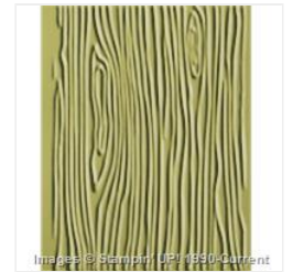
Woodgrain Textured Impressions Embossing Folder - 127821