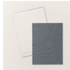
Countryside Blossoms Embossing Folder - 161473 Price: $8.50