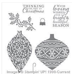
Embellished Ornaments Wood- Mount Stamp Set - 139756