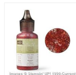
Cherry Cobbler Dazzling Details - 125585