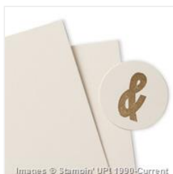
Vanilla Coaster Board - 129392