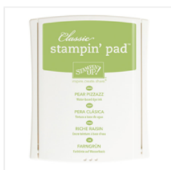
Pear Pizzazz Classic Stampin' Pad - 131180