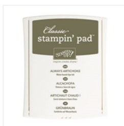
Always Artichoke Classic Stampin' Pad - 126972