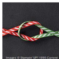
Real Red & Garden Green 1/8" (3.2 Mm) Striped Ribbon - 139615