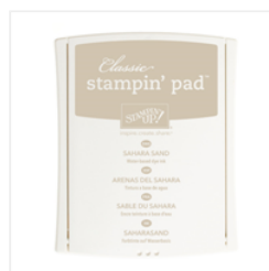
Sahara Sand Classic Stampin' Pad - 126976