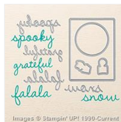
Seasonal Frame Thinlits Dies - 139658