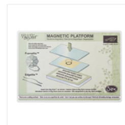
Magnetic Platform - 130658