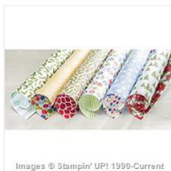
Season Of Cheer Designer Series Paper - 139590