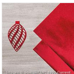
Red Foil Sheets - 139607