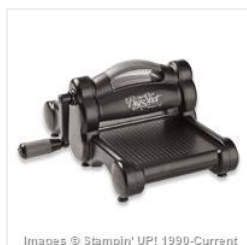
Big Shot - 113439