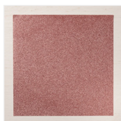
Rose Glimmer Paper - 146959