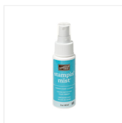
Stampin' Mist - 102394