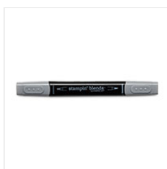
Smoky Slate Dark Stampin' Blends Marker - 145055