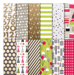
Broadway Bound Speciality Designer Series Paper - 146277