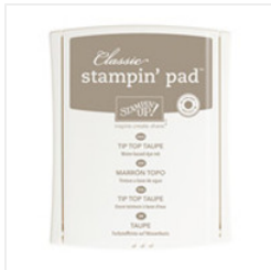
Tip Top Taupe Classic Stampin' Pad - 138325 Price: $6.50