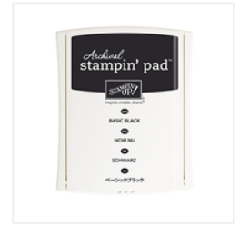
Basic Black Archival Stampin' Pad - 140931 Price: $7.00