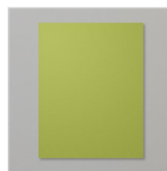
Old Olive 8-1/2" X 11" Cardstock - 100702