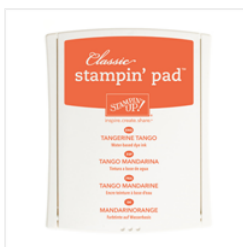
Tangerine Tango Classic Stampin' Pad - 126946