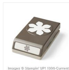
Fun Flower Punch - 133785