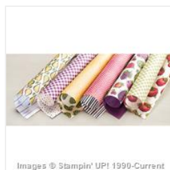
Farmers Market Designer Series Paper - 138448