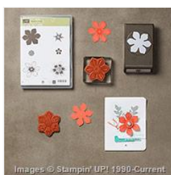
Beautiful Bunch Clear-Mount Bundle - 140259