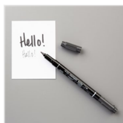
Basic Black Stampin' Write Marker - 100082