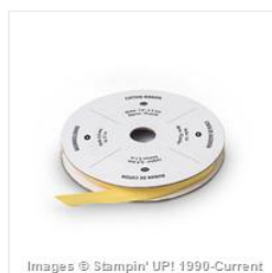
Daffodil Delight 1/4" Cotton Ribbon - 134559