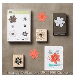
Beautiful Bunch Wood-Mount Bundle - 140258