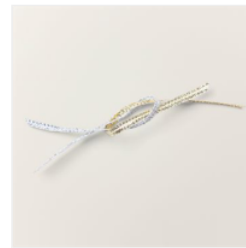
Gold & Silver 1/8" (3.2 Mm) Trim Combo Pack - 161633