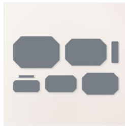
Countryside Corners Dies - 161471