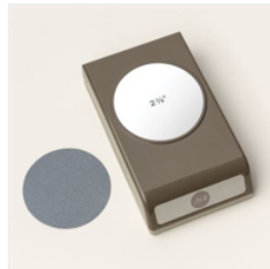
2-3/8" (6 Cm) Circle Punch - 161354