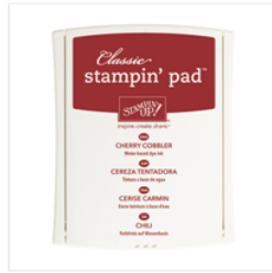
Cherry Cobbler Classic Stampin' Pad - 126966