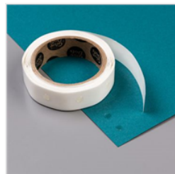
Glue Dots - 103683