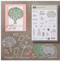
Thoughtful Branches Photopolymer Bundle - 144328