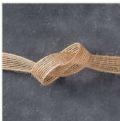
5/8" (1.6 Cm) Burlap Ribbon - 141487