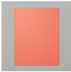
Calypso Coral 8-