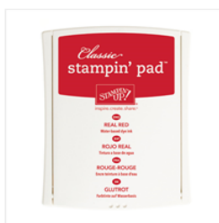
Real Red Classic Stampin' Pad - 126949