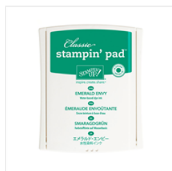
Emerald Envy Classic Stampin' Pad - 141396