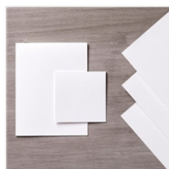
Whisper White 8-1/2\"/>