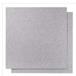
Silver Glimmer Paper - 135314