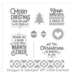
Wrapped In Warmth Wood-Mount Stamp Set - 142051