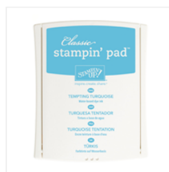
Tempting Turquoise Classic Stampin' Pad - 126952