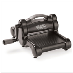
Big Shot - 143263