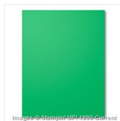
Cucumber Crush 8-1/2\"/>