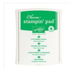
Cucumber Crush Classic Stampin' Pad - 138324