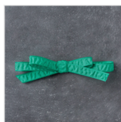
Emerald Envy 3/8\"/>