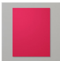
Real Red 8-1/2\"/>