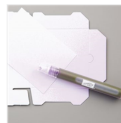
Stampin' Spritzer - 126185