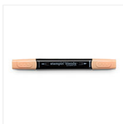
Pumpkin Pie Light Stampin' Blends Marker - 144578