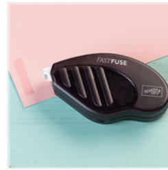
Fast Fuse Adhesive - 129026