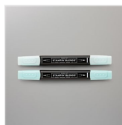
Pool Party Stampin' Blends Combo Pack - 144605