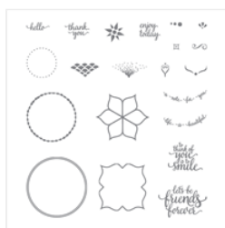
Eastern Beauty Photopolymer Stamp Set - 143675