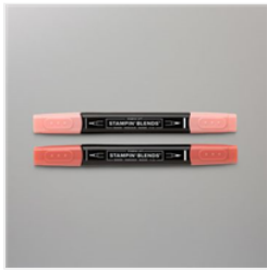
Calypso Coral Stampin' Blends Markers Combo Pack - 144045

Stesha Bloodhart 7154976313 Stesha@stampinhoot.com stampinhoot.com