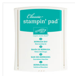
Bermuda Bay Classic Stampin' Pad - 131171