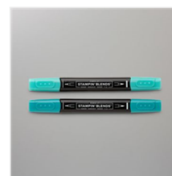
Bermuda Bay Stampin' Blends Combo Pack - 144600