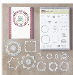
Eastern Beauty Photopolymer Bundle - 145308