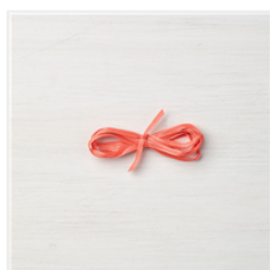
Calypso Coral 1/8" Sheer Ribbon - 144173