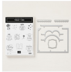
Treat Time Wood-Mount Bundle - 148371