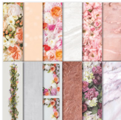
Petal Promenade Designer Series Paper - 146913