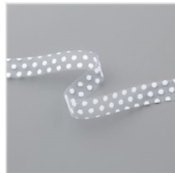
Whisper White 5/8" (1.6 Cm) Polka Dot Tulle Ribbon - 146912