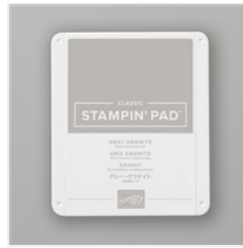
Gray Granite Classic Stampin' Pad - 147118