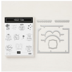
Treat Time Clear-Mount Bundle - 148372