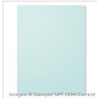
Soft Sky 8-1/2" X 11" Cardstock