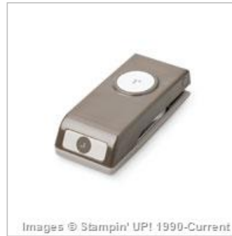
1" (2.5 Cm) Circle Punch