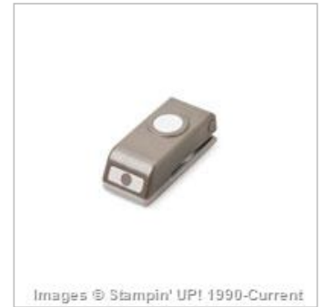
1/2" (1.3 Cm) Circle Punch