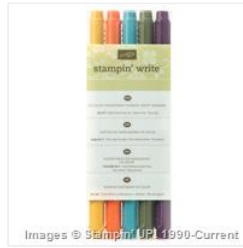
2014-2016 In Color Stampin' Write Markers - 133654