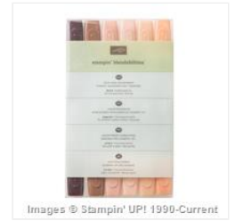
Stampin' Blendabilities™ Markers Skin Tone Assortment - 129370