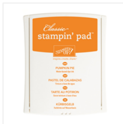
Pumpkin Pie Classic Stampin' Pad - 126945