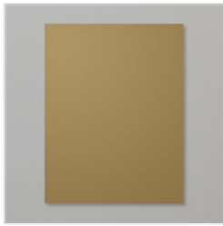
Soft Suede 8-1/2\" data-bbox="75 235 220 289"/>