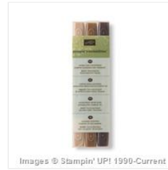
Stampin' Blendabilities™ Markers Crumb Cake Assortment - 131004