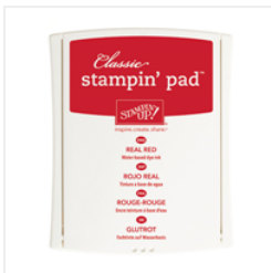
Real Red Classic Stampin' Pad - 126949