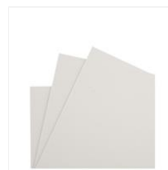
Color Splash Watercolor Sheets - JM-0076