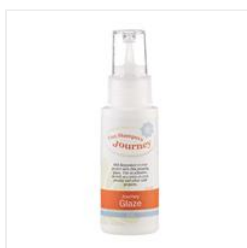
Journey Glaze 2 oz - AD-0003