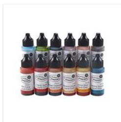
Liquid Color Bundle - BD-0303