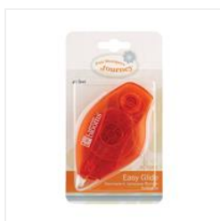
Easy Glide Permanent Adhesive Runner - AD-0081