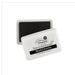
Black Licorice True Color Fusion Ink Pad - IP-0041