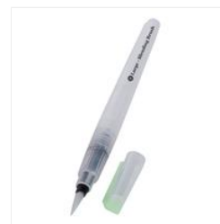
Journey Blending Brush (large) - TO-0099