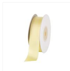
Satin Ribbon Sweet Pear - AC-0137