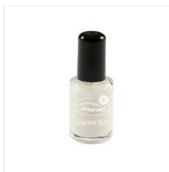
Sparkle Silk - IP-0126