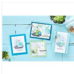
Bloom Box - One-Time Purchase - KO-0003