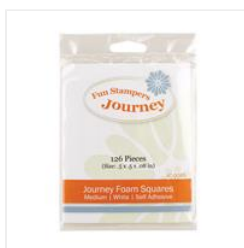
Journey Foam Squares - medium - AD-0085