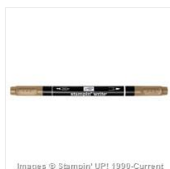
Crumb Cake Stampin' Write Marker - 120967