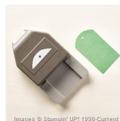
Ornate Tag Topper Punch - 137416