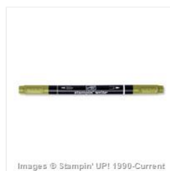
Old Olive Stampin' Write Marker - 100079