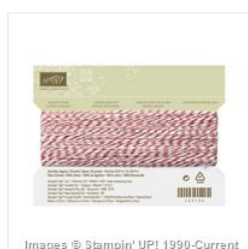
Cherry Cobbler Baker's Twine - 123125