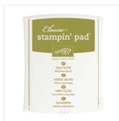
Old Olive Classic Stampin' Pad - 126953