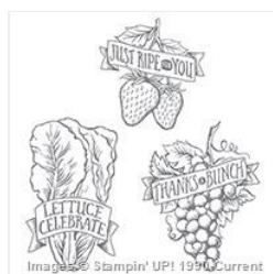
Market Fresh Clear-Mount Stamp Set - 139344