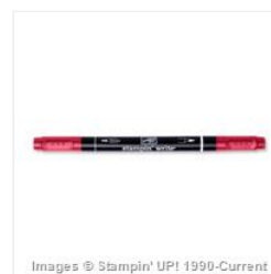
Real Red Stampin' Write Marker - 100052