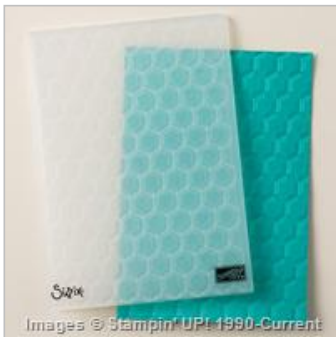
Hexagons Dynamic Textured Impressions Embossing Folder