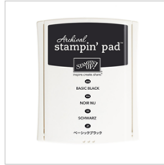
Basic Black Archival Stampin' Pad