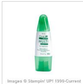
Multipurpose Liquid Glue