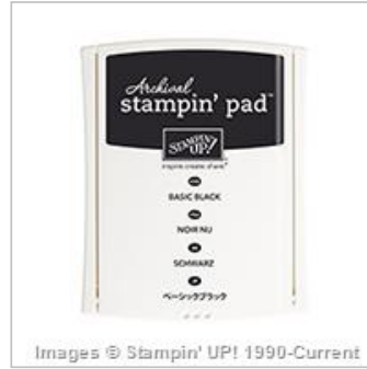
Basic Black Archival Stampin' Pad