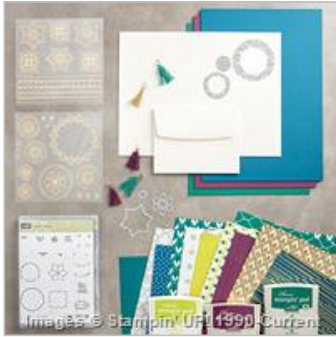
Eastern Palace Premier Bundle