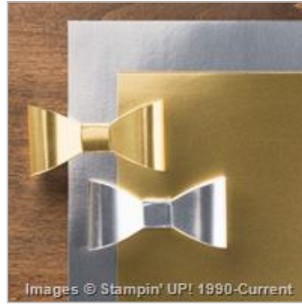
Gold Foil Sheets